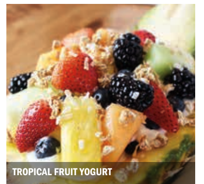
TROPICAL FRUIT YOGURT

A half pineapple filled with Greek yogurt and fresh fruit topped with granola and toasted coconut.