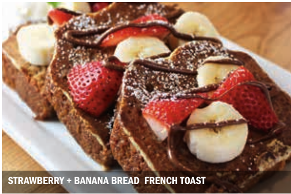
STRAWBERRY + BANANA BREAD FRENCH TOAST

Boneless, buttermilk fried chicken and a malted waffle. Served with warm bourbon maple syrup.