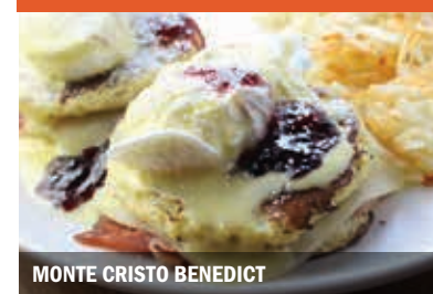
MONTE CRISTO BENEDICT

Brioche bread, smoked ham, Havarti cheese, grape jelly, powdered sugar and hollandaise sauce (no English muffin).