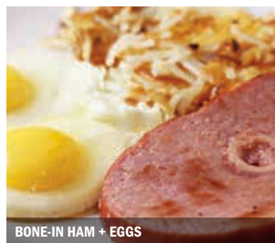
BONE-IN HAM + EGGS

Corn tostadas, Chihuahua cheese, black beans, ranchero sauce, cilantro and Cholula® sour cream. Choice of carnitas pork, chorizo, or chicken chorizo (no toast).