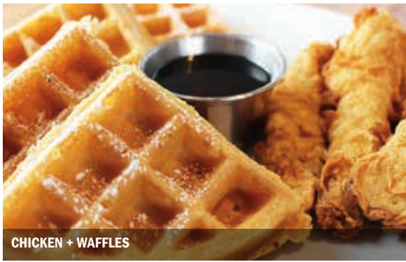
CHICKEN + WAFFLES